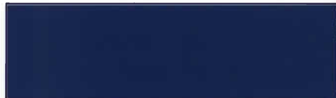
Regal Blue (RU)