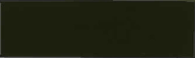
Patrician Bronze (ZK)