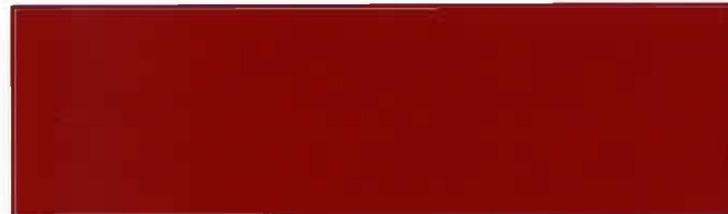
Ultra Brite Red (UB)

★Kynar is a premium paint system. Consult your builder on pricing of this quality.