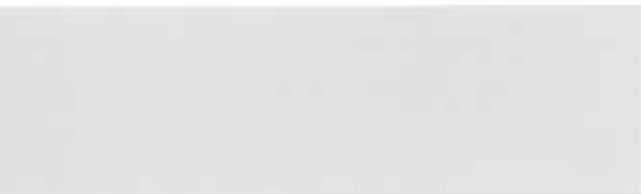
Regal White (WK)

★Kynar is a premium paint system. Consult your builder on pricing of this quality.